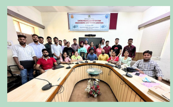
Group Photo with trainees during training on "Fish Processing and Value Addition"

Therefore, a training programme on this topic was conducted in association with School of Organic Farming, PAU from August 23-25, 2023. It was attended by 29 farmers who learnt the organic production methods for fruits, vegetables, medicinal, and aromatic plants. Training also included exposure visits to Integrated Farming System model and organic crops demonstration fields at PAU, Ludhiana.