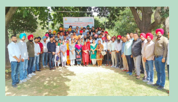
ATMA officials from across Punjab during workshop for promotion of central govt. sponsored schemes