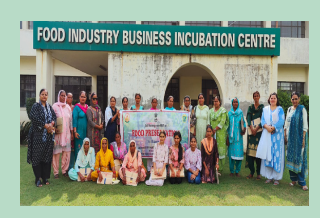
Group photo during Training on Food Preservation at Food Industry Business Incubation Centre, PAU, Ludhiana