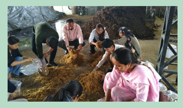
Learning by Doing: trainees preparing compost for "Mushroom Cultivation"