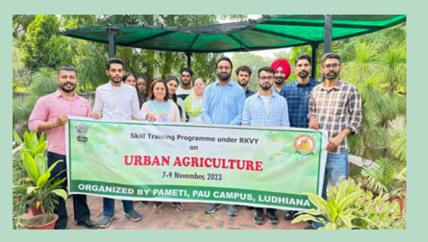
Group photo during training on "Urban Agriculture" at PAMETI