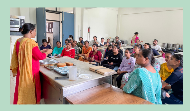
Practical session on preparing value added products of millets at Dept. of Food and Nutrition, PAU