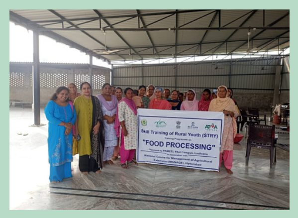
Group Photo during Training on "Food Processing" conducted by ATMA Fazilka under STRY

PAMETI, in association with Department of Food and Nutrition, PAU organized a skill training program titled "Bakery Products" from October 16-18, 2023. A total of 27 participants from in and around Ludhiana attended this training.